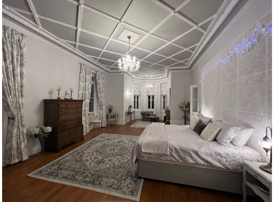
The Bridal Suite

Our bridal suite is the 'jewel in our crown'. Completed in 2022 and revealed on UK Channel 4's 'Château DIY' & 'Château XXL' in France). It comprises a majestic bedroom with relaxation area, 'Emperor' size bed, with unique Moroccan style headboard (Zion's own handiwork!), two fireplaces and a unique wedding dress 'safe'. Adjoining the bedroom is a luxurious ensuite bathroom with a traditional 'slipper' bath in front of a fireplace, and a 'Hammam' style steam shower for two people. There is also a south-facing, private balcony overlooking our wedding garden. The ensuite leads into a separate dressing room & WC closet with bidet.