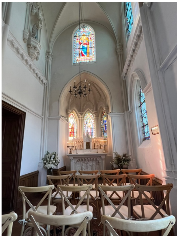
La Boutinière Chapel

In addition to the above, inside the château we have a small chapel which could be used for small wedding ceremonies. Our 'Painted Salon' or Dining Hall are suitable for inside dining, or you can choose to dine inside or outside (weather permitting) our Hunting Lodge in the château grounds.