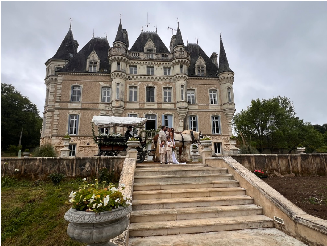
View of the château's rear elevation

A photo with all your guests on the front steps of Château de la Boutinière, with you on the romantic 'Romeo & Juliet' balcony, above them is a must! Opposite the Château's southern elevation, we are in the final stages of creating a beautifully landscaped wedding garden with a fountain and with the chateau as its dramatic backdrop (illuminated at night). The wedding garden is also being thoughtfully designed to provide photo opportunities at every turn for you and your guests, including a flower-arch, a rope swing adorned with flowers and an illuminated ornamental pond. The garden terrace will be set-up with tables and chairs for relaxing with your friends and family. If you are having a celebration marquee (we can suggest a local marquee supplier) the garden will lead guests to the marquee.