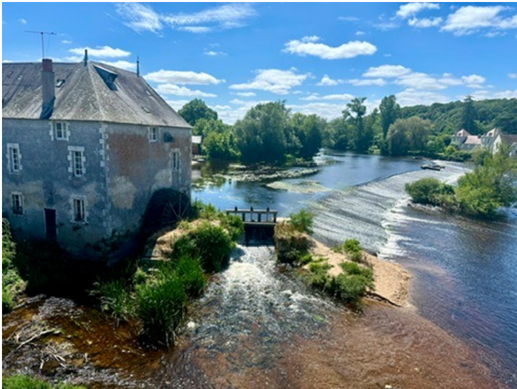
Our local Village Saint Pierre de Maillé

Email info@boutiniere.fr Website www.chateaudelaboutiniere.com