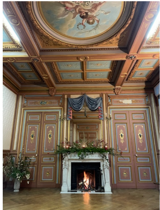
The 'Painted Salon'

If you plan to use a DJ, we can either work closely with your own DJ or help to source one locally. Alternatively, if you prefer 'live' music, we can suggest local musicians and/or live bands to create your ultimate party. One such band is Elon Kane, a great French 4-piece party band. You can listen to them here: www.elonakane.com . After the wedding banquet, the marquee, or our hunting lodge can be transformed into a party venue with lights, music and dancing throughout the evening and into the night (we don't have a curfew here!).