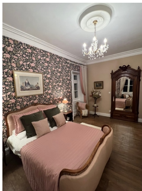
The Josephine Suite

Our château bedroom suites comprise a double, or twin bedroom, with an ensuite, or dedicated shower room. Please note that several suites are situated on 2 nd floor of the château which has 76 stairs and no lift!