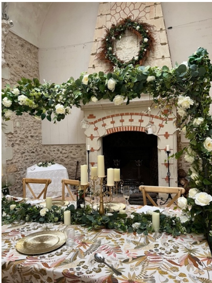
Hunting Lodge interior

For a 'table service' banquet your French Traiteur will also provide waiting staff on the wedding day, to serve drinks and the wedding banquet (cost included in your food quote). Rest assured, we will be on-hand before, through-out and after your event to help co-ordinate everything, to answer questions and to make sure everything runs smoothly!