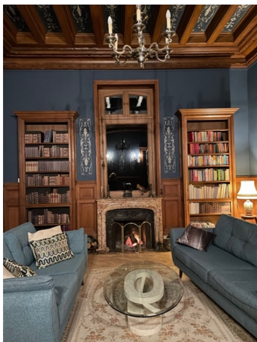
The Chapel Suite

~ Cost per château suite from €150 per night (including luxury continental style breakfast)