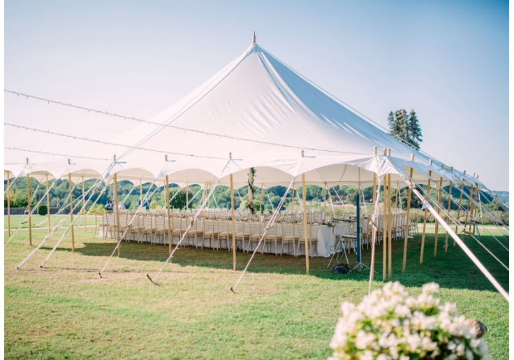
'Petal' Marquee

We work closely with the 'La Bonne Fete' marquee company who offer beautiful marquees of different sizes, which can be constructed in our wedding garden, with dramatic views of the château. There are 3 different 'Petal marquee' sizes to choose from, each comes with integral floor, circular or rectangular tables, and a choice of festoon, or chandelier lighting. All designed with your wedding feast and partying very much in mind! Please note, the cost of a wedding marquee is in addition to the basic venue price.