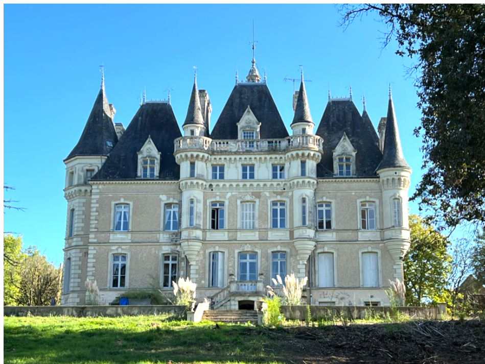
Northern façade of the chateau

Château de la Boutinière is a truly romantic 'fairy-tale' Château surrounded by a 'mystical' forest. The 150-year-old 'La Boutinière' Estate comprises 52 acres of beautiful, French countryside, which includes a romantic 'English Park' featuring centuries old trees and a wild-flower meadow. This imposing Château, in its magical setting, creates a beautiful backdrop for weddings and events.