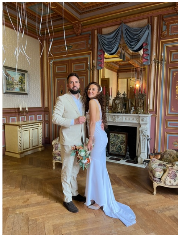
The 'Painted Salon'